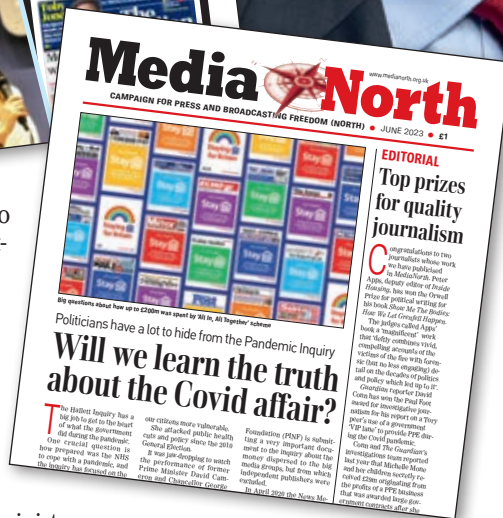
Gove's role in VIP lane exposed. Left: coverage of Covid corruption in previous issues of MediaNorth

Conservative party grandee and former Cabinet Office minister Michael Gove's role in ensuring James Dyson was awarded a contract to provide 10,000 ventilators as part of the 'Ventilator Challenge'.