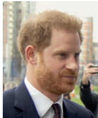
Prince Harry: Royal victim

But victims of hacking at both papers began lining up civil cases by the dozen. Every single one of these was bought out by Murdoch to prevent cases being aired in court. In all he is reported to have paid more than £1 billion to protect his secrets.