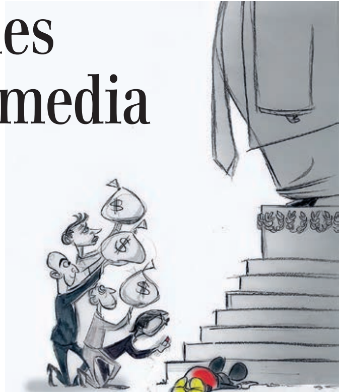
The cartoon by Ann Telnaes blocked by the Washington Post

ways. Take that notorious confrontation in the White House between Zelensky, Trump and Vance which went out live on television.