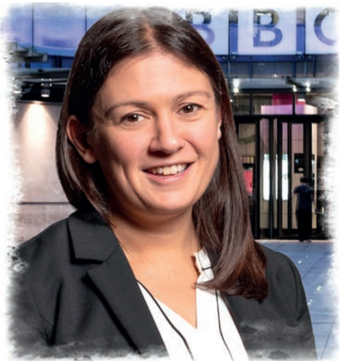
Lisa Nandy: “Honest national conversation”

A new framework that does not include changing the commercial media regulator Ofcom