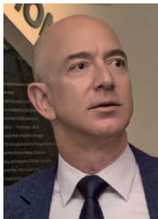
Jeff Bezos. According to Forbes , he's the third richest individual in the world

Trump is disrupting how the US media functions in other